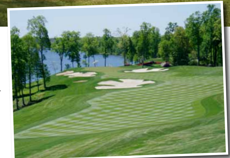
RIGHT: Robert Trent Jones GC, 10th hole